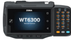
WT6300 WEARABLE COMPUTER