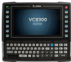
VC8300 VEHICLE MOUNT COMPUTER