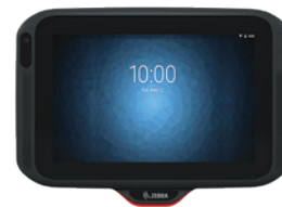
CC600 / CC6000

To learn more about Zebra's commitment to IT security, visit: zebra.com/product-security