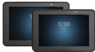
ET51 / ET56