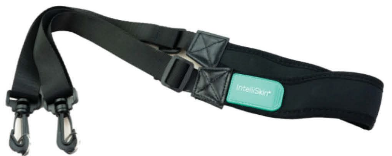
3PTY-RAM-GDS-SS1U GDS® Shoulder Strap Accessory