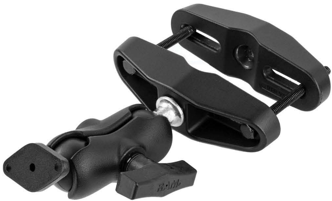
3PTY-RAM-102U-B-247 RAM® Forklift Mount C-Size with Short Arm