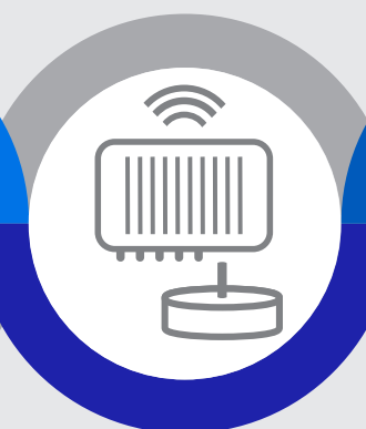
Fixed Readers and Antennas