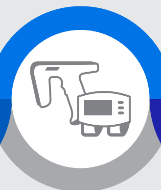
Handheld and Handsfree RFID Readers