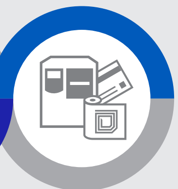
Printer Encoders, Inlays, Labels and Cards